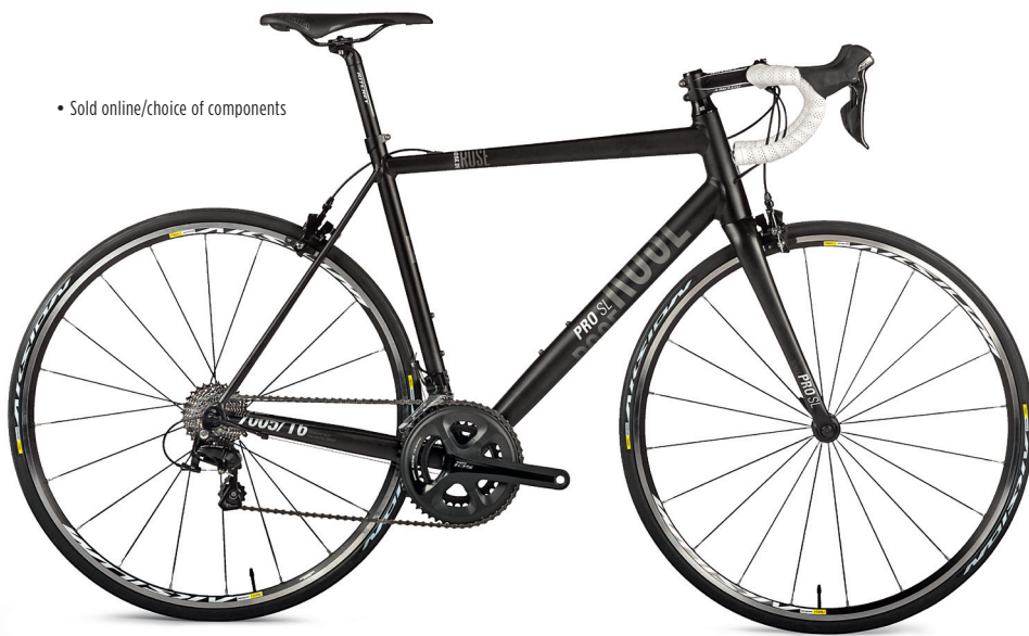
• Sold online/choice of components

High quality, lightweight frameset with comfortable seating position and sound equipment. Up to size 65 available