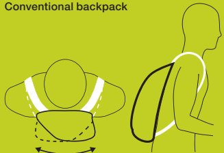
Conventional position of the shoulder straps – instable load shifting during the ride